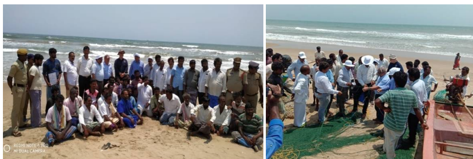
US DoS team visit at Andhra Pradesh

During the month SCO NETFISH Coordinated with RD MPEDA Vizag for conducting 3 batches of PMKVY training programmes. The programmes were conducted at Seafood processing and exports units of M/s. Abad overseas Pvt Ltd, Visakhapatnam, M/s. SSF Pvt Ltd, Visakhapatnam, and M/s. Ever blue sea foods Pvt Ltd, Visakhapatnam. SCO gave detailed class on various aspects such as hygiene & sanitation practices in fish & seafood sector, chlorination level, cleaning & sanitation process, cleaning schedule, HACCP system, GMP, SSOP & SOP, spoilage of fish, freezing, fish preservation techniques, traceability of product etc.