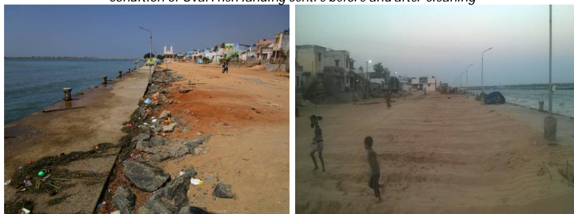
Condition of Uvari fish landing centre before and after cleaning

The data regarding fish landing and boat arrival during March 2019, in 4 harbours of Tamil Nadu South region under the concerned data collectors is given below.