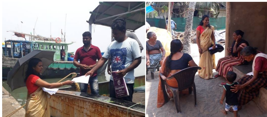
Mass communication & Door to door programme

In addition to the above, the following are the works and activities performed during the month.