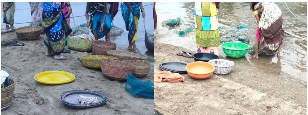
Before-Use of Bamboo baskets

> Use of plastic baskets for fish washing for drying at Satpati LC