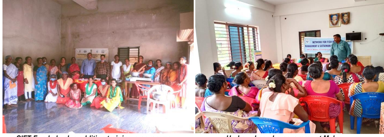
CIFT Funded value addition training programme