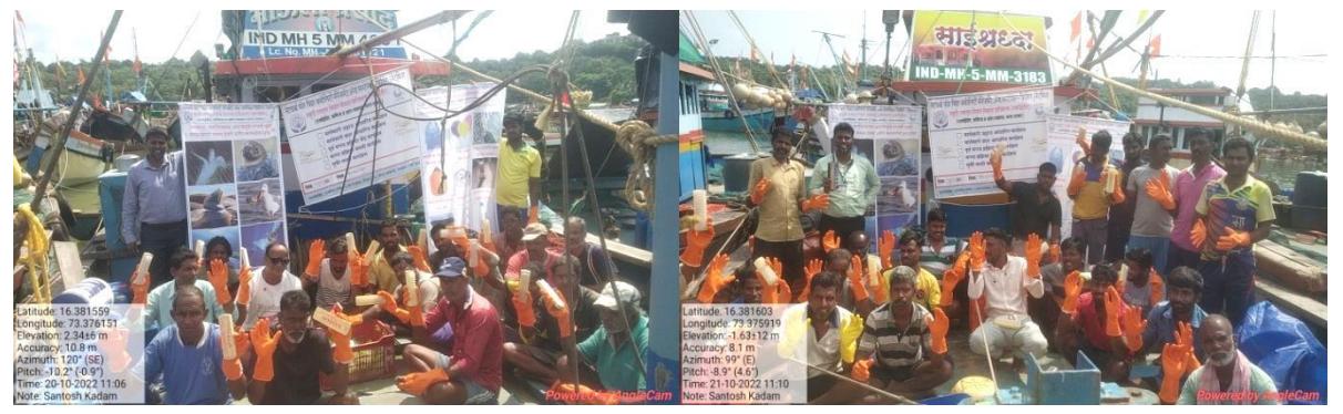
Fishing Harbour based programmes at Devgad