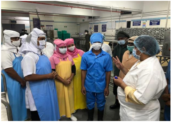
Seafood processing centre training at Vizag