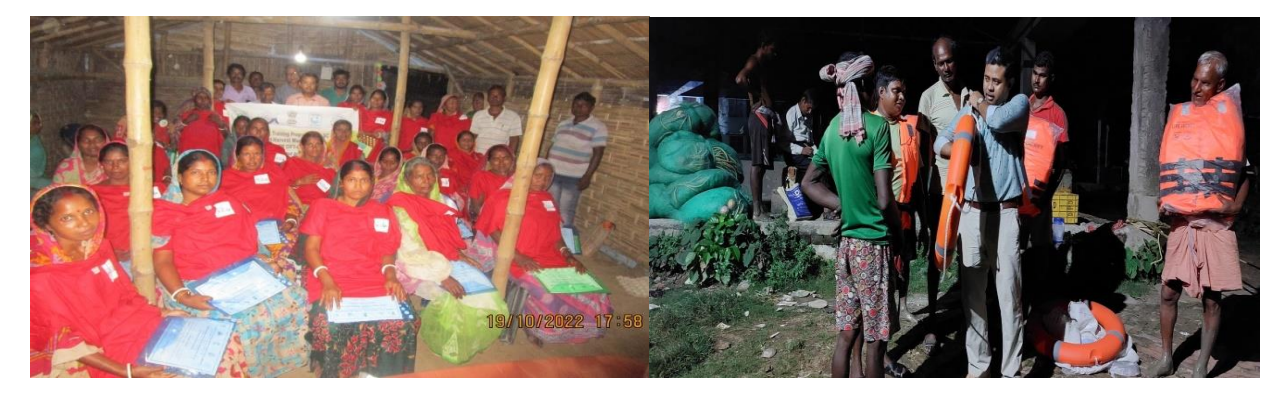
CIFT sponsored dry fish training at Purba Medinipur