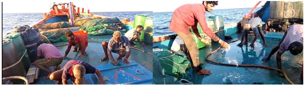
Cleaning of fishing vessels

> TED poster pasted in the harbour premises to create awareness on implementation of TED in fishing vessel.