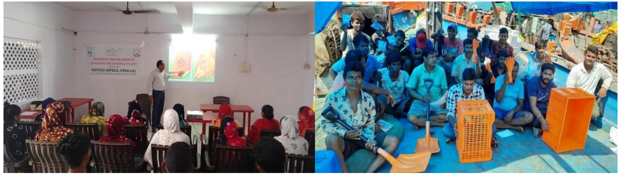
Seafood processing centre programme at Veraval