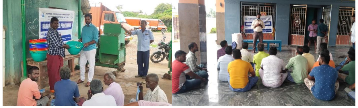
Harbour based programmes at Cuddalore