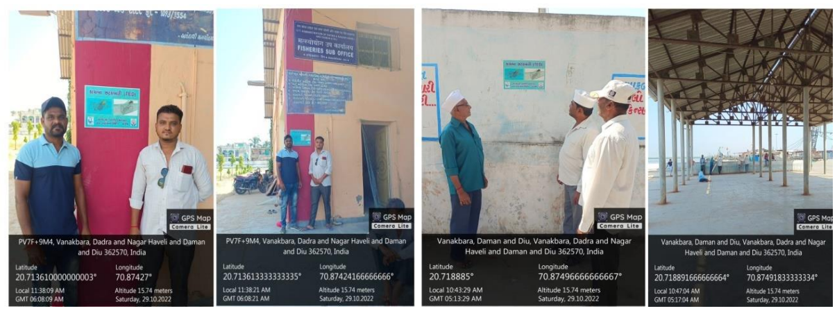
Fisheries Office, Vanakbara

> TED poster pasted in the harbour premises to create awareness on implementation of TED in fishing vessel.