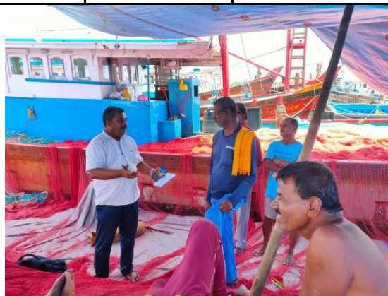
SCO involved in MM& T Survey