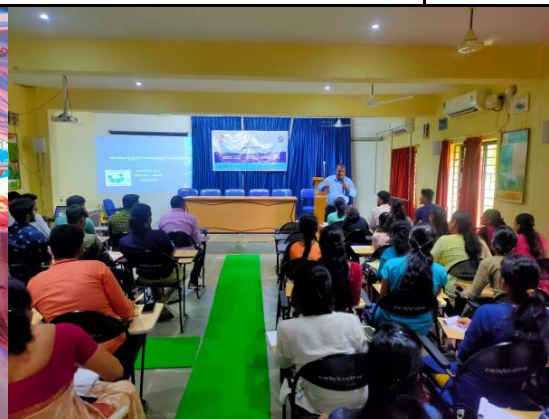
SCO delivered class for Sagarmitra Staffs