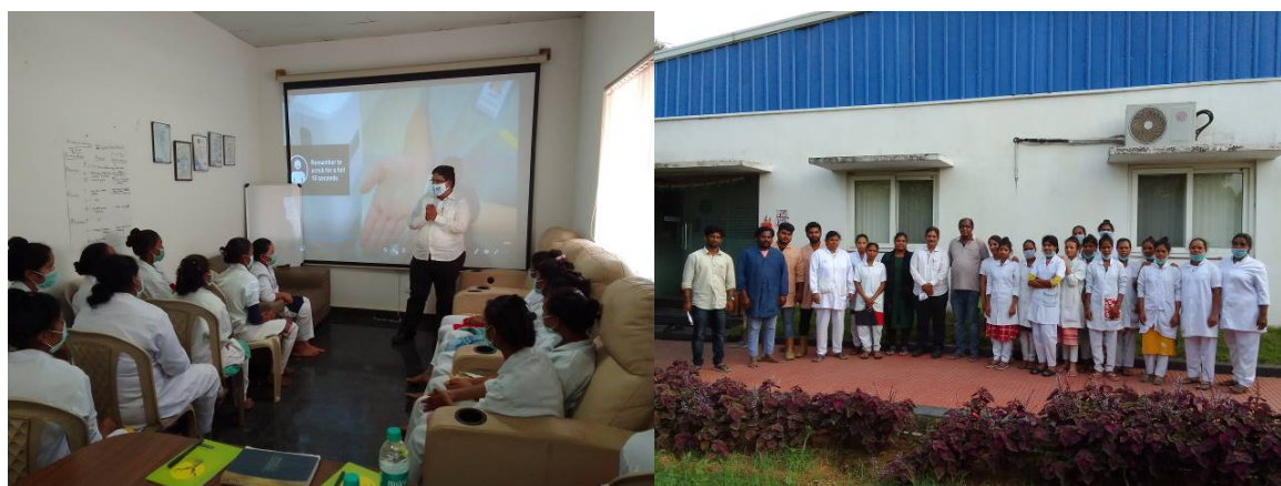
Seafood processing unit programme

During the month, the HDCs of AP North coastal region had conducted Marine mammal and sea turtle by catch survey in 77 boats which includes Visakhapatnam harbour (13 boats), Pudimadaka fish landing center (18 boats) and Kakinada fishing harbour (46 boats).