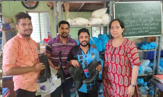
Gumboots distributed during Harbour programme