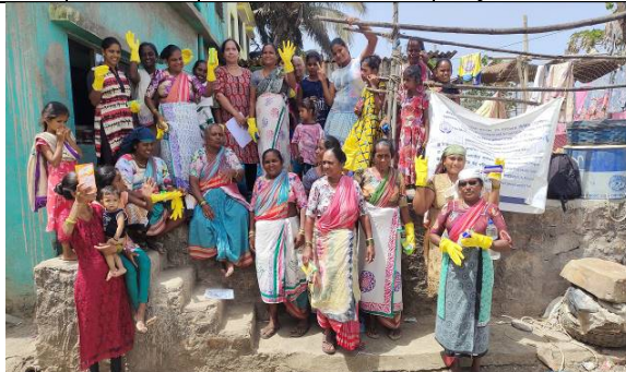
Dry fish awareness programme at Uttan