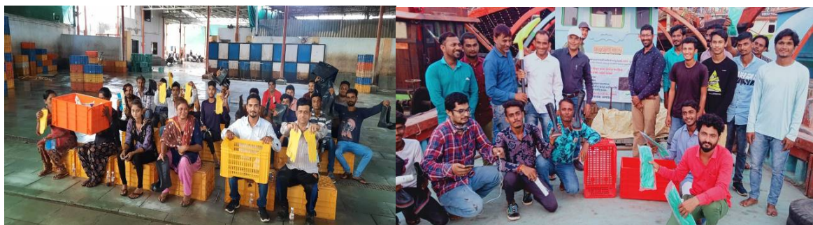
Fishing Harbour programme at Porbandar