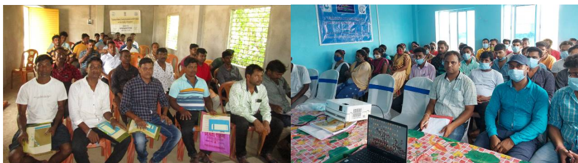
Sea Safety & Navigation under MPEDA SC/ST scheme

NETFISH, Kolkata had organized a one day training programme at M/s. Aquatech Feed & Sea foods Pvt. Ltd, Howrah to the processing technologists, supervisors, managers and workers regarding COVID-19 guidelines, hygiene & sanitation practices, fish processing technology etc. A total of 41 trainees had attended the training programme.