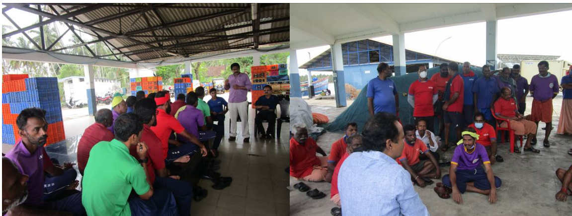
Harbour based programme at Munakkakadavu