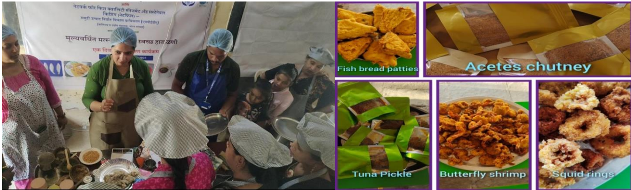
Mangrove Foundation sponsored Value added training program