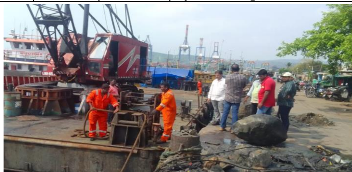
Vizag Harbour visit along with port officials