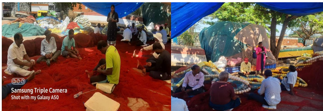
Awareness programs conducted by HDCs