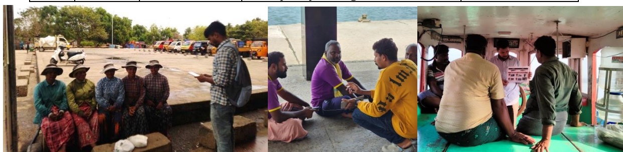
Awareness by HDCs