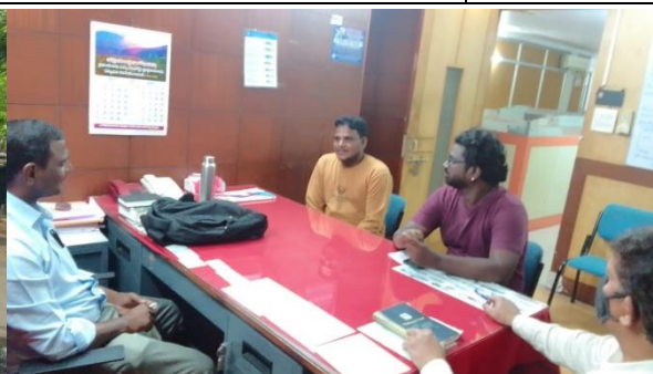
Meeting with HDCs