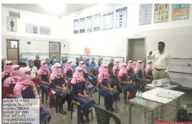
Seafood processing centre programme