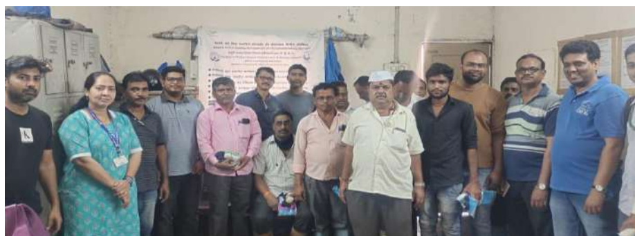
Harbour based programme at New ferry Wharf