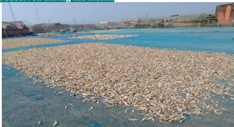
Hygienic drying of fish on net to minimize contamination