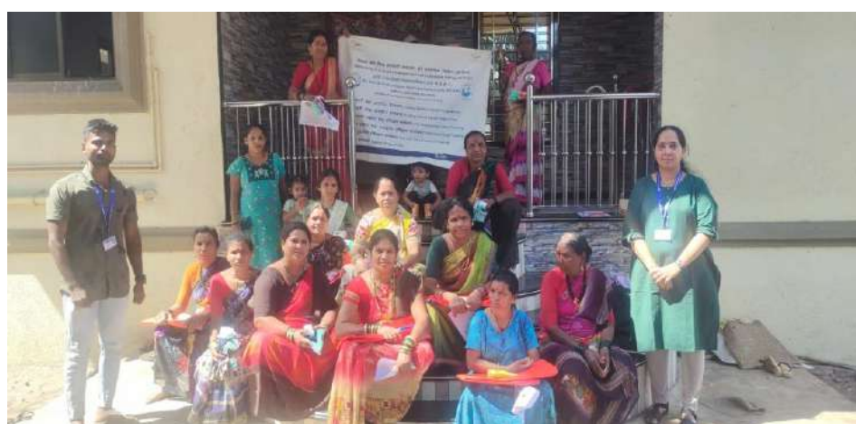
Dry fish awareness programme at Arnala