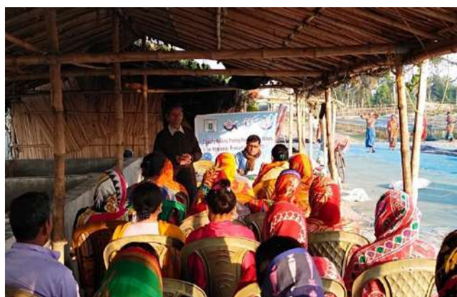
CIFT sponsored Dry fish training at Bakhali