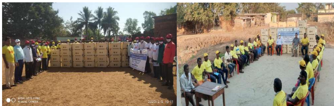
MPEDA funded awareness programmes at Chilka