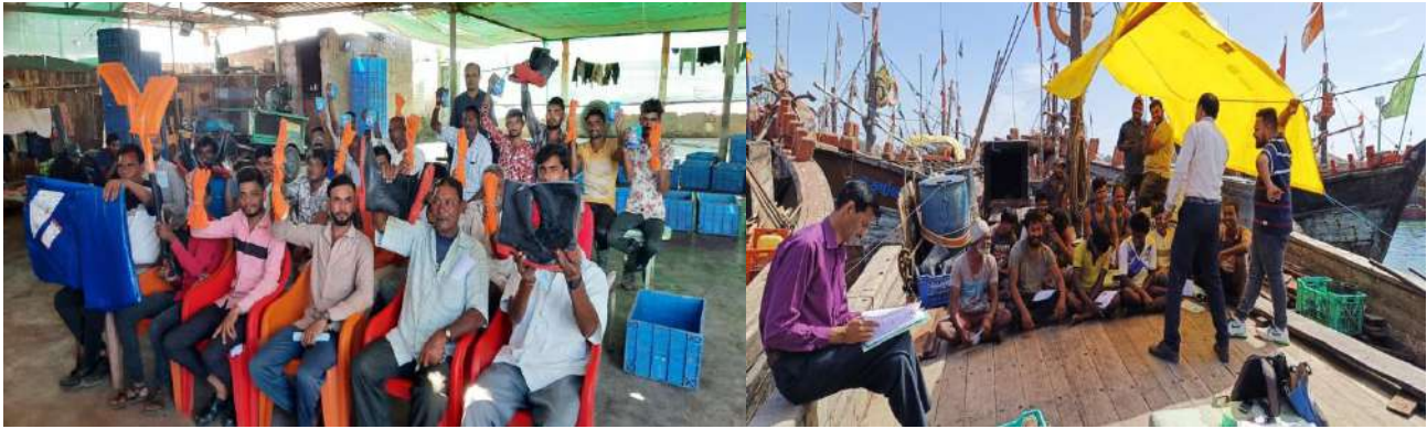
Harbour based programmes at Mangrol & Porbandar