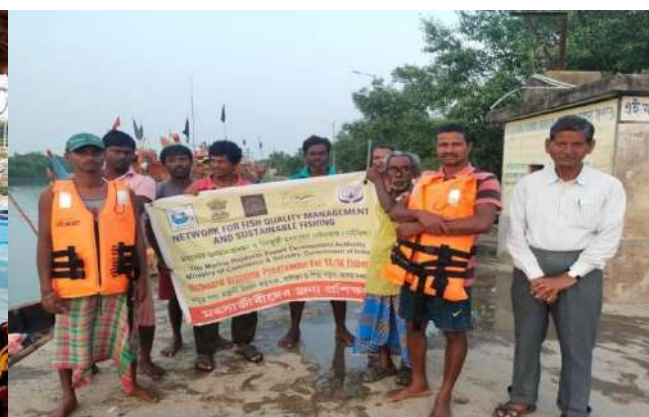
MPEDA funded On board training at Freserganj