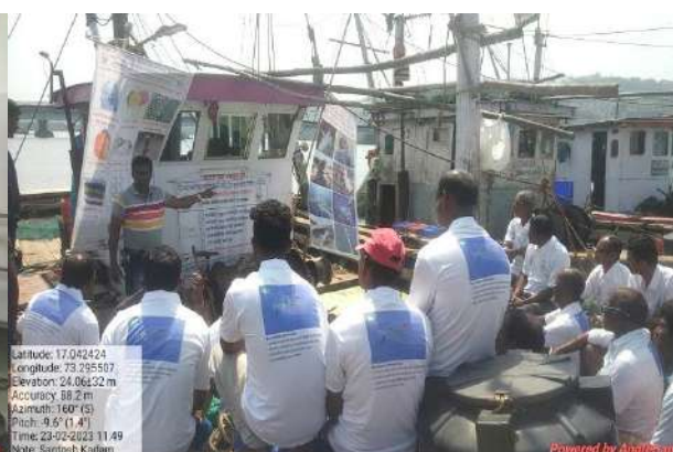
Harbour based programmes at Mirkarwada