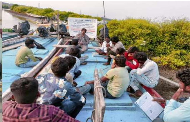
Fishing Harbour based programme at Pudimadaka