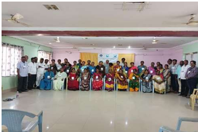
Dry fish training programmes at Vizag