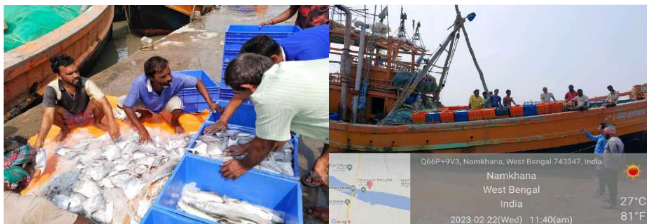
Use of Polysheets and crates for catch handling