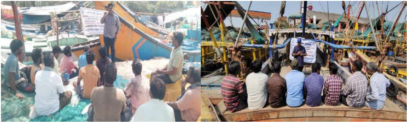
Fishing Harbour based programmes at Nizampatnam