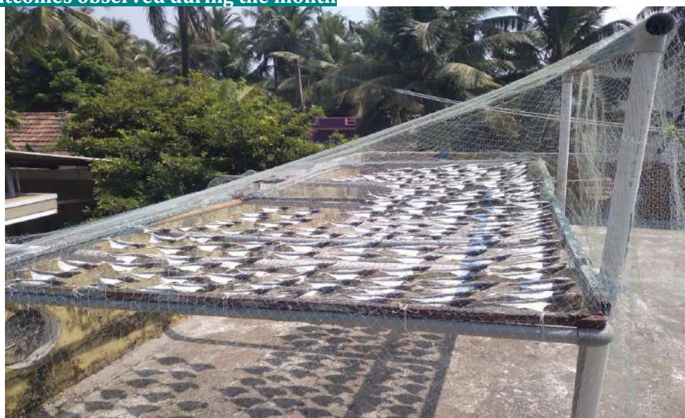
Fish drying in a hygienic manner