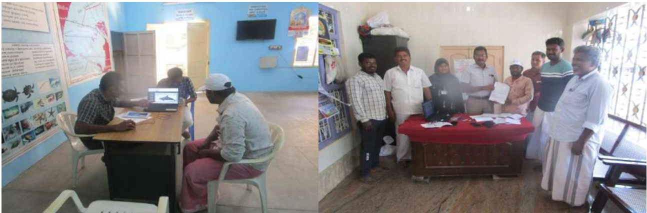
Marine Observer training programme