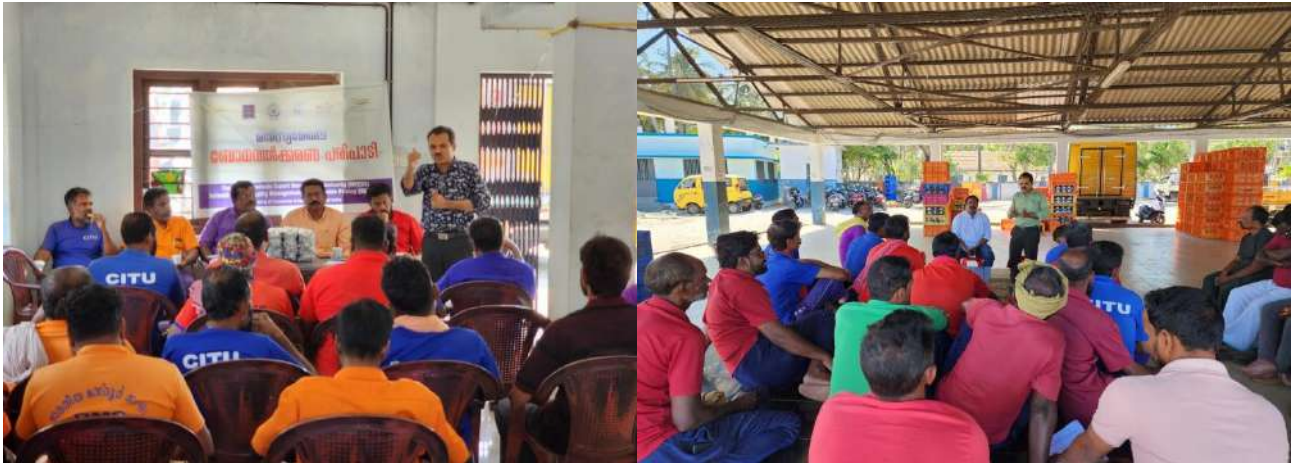
Harbour based programmes at Chettuva & Munakkakadavu