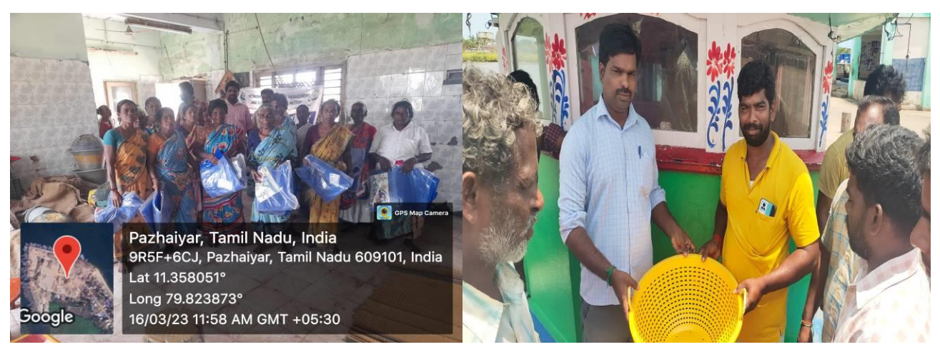
Harbour based programme at Pazhaiyar