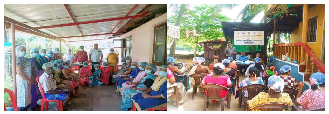
CIFT funded Value addition training programmes at Malpe