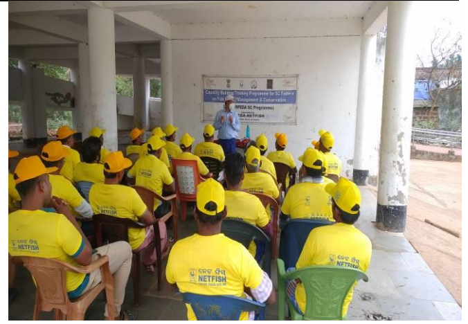
MPEDA funded awareness programmes at Chilka