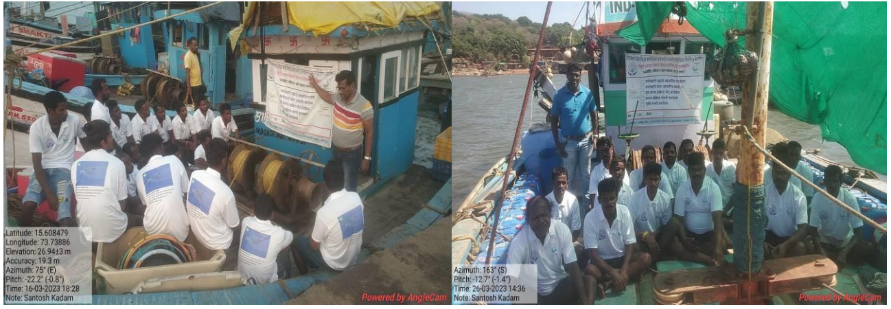
{\it Harbour\ based\ programmes\ at\ Chapora\ \&\ Devgad}