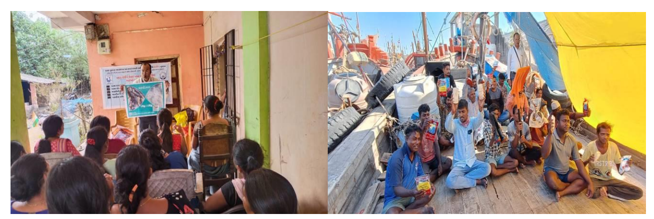
{\it Dry fish \ awareness \ programme \ at \ Umargam}