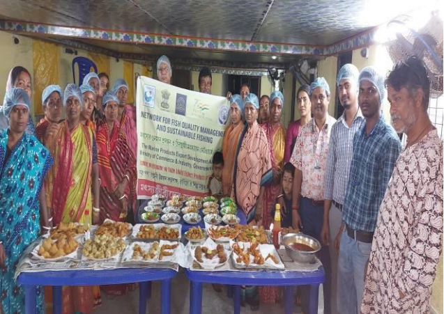
MPEDA funded Value added training at Bidyapith