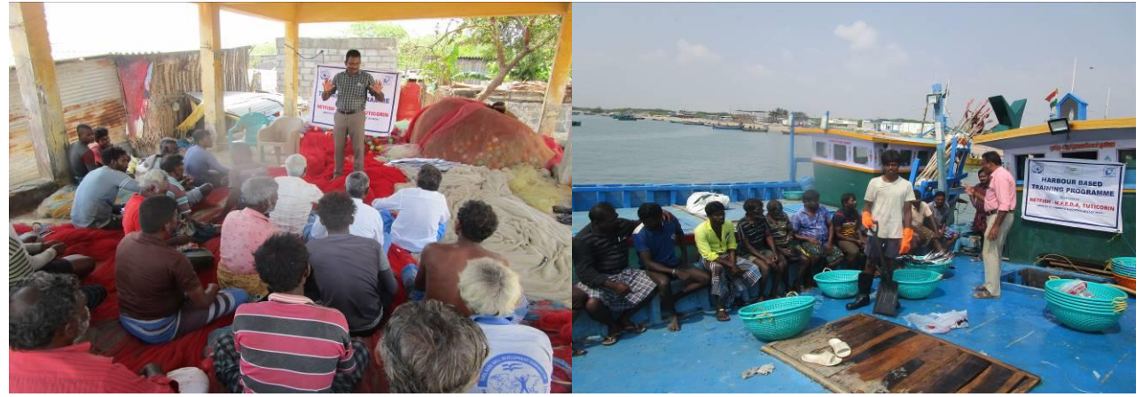
Harbour based programe at Vivekananda Nagar