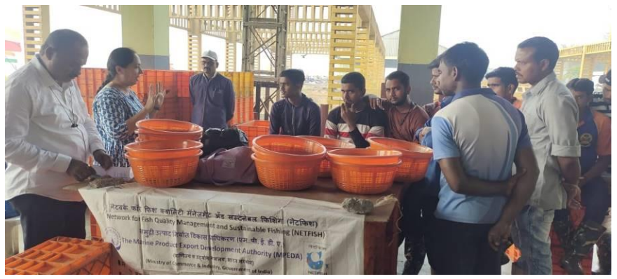
{\it Harbour\ based\ programme\ at\ Sasson\ dock\ FH}