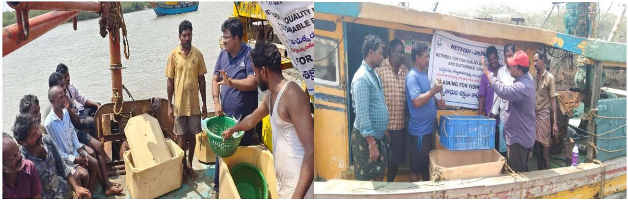
Fishing Harbour based programmes at Nizampatnam