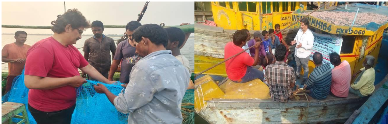
Fishing Harbour based programme at Kakinada & Vizag