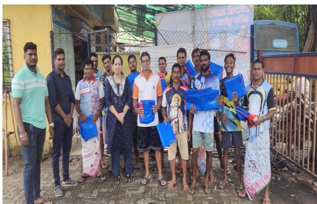
Fishing Harbour based training at Uttan