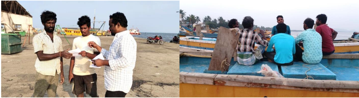
Awareness by HDCs