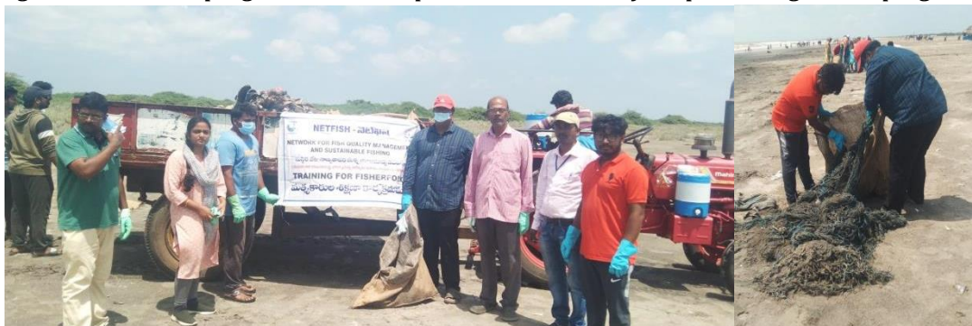
Participation in the INCOIS clean-up program at Manginapudi beach