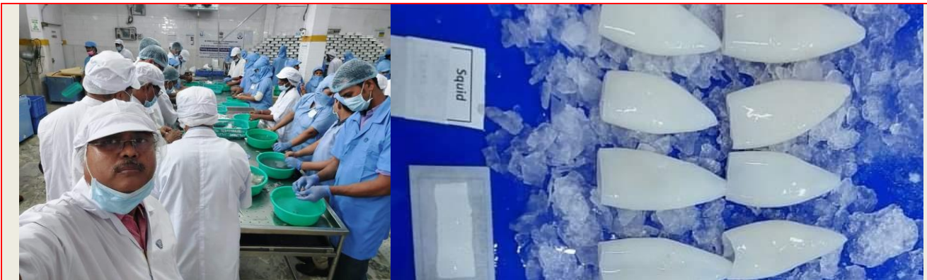
One day Hands on training programme on Value Added Cephalopods conducted on 27.09.2023. A total of 32 participants including Managers, Technologists, Supervisors and workers were actively participated in the training programme. Demonstrated various value added products of Cephalopods meant for export such as Whole clean Cuttlefish, Squid, Squid ring, Squid tentacles, Stuffed Squid, Octopus clean, tray pack etc.