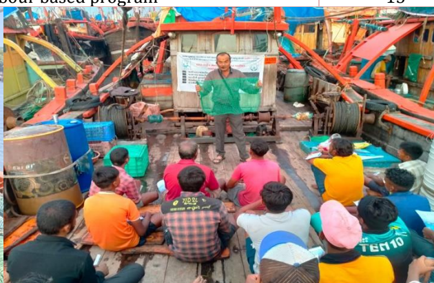
Fishing Harbour based program at Veraval