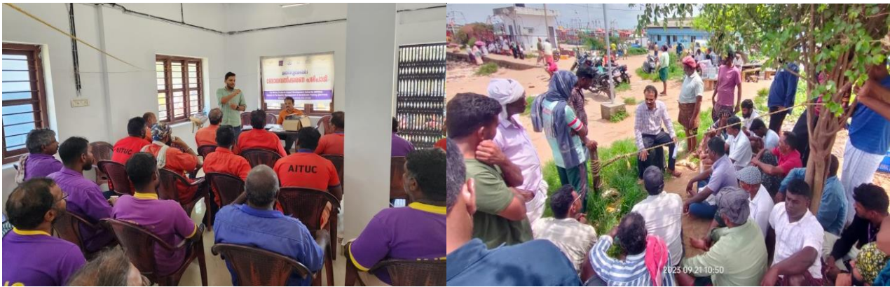
Fishing Harbour program at Chettuva