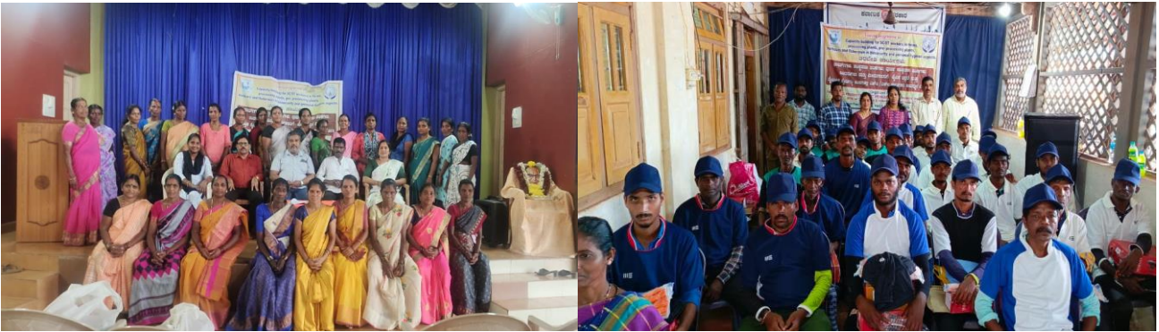
MPEDA funded awareness programs for SC fishers at Malpe & Tadri