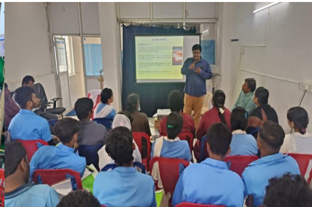
Seafood processing centre program