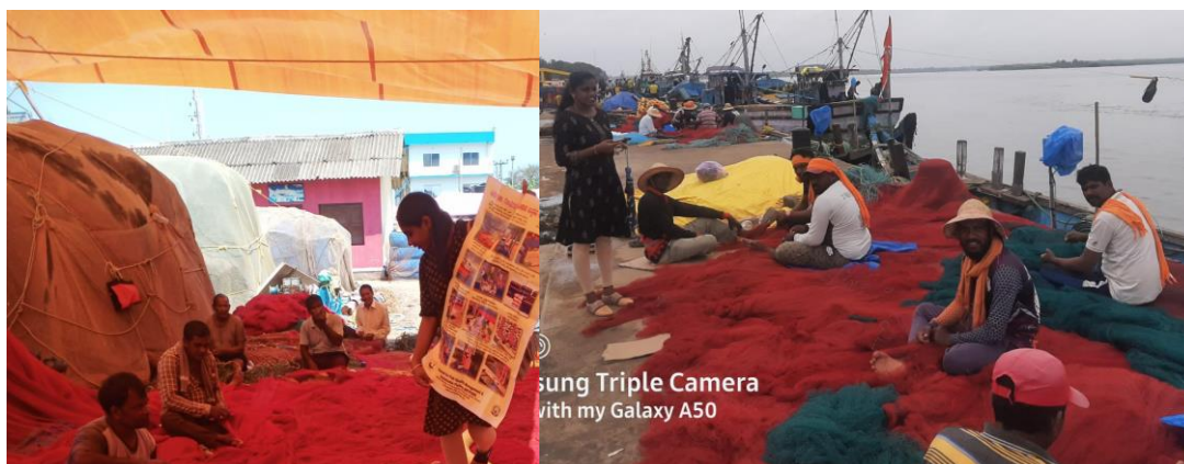
Awareness by HDCs