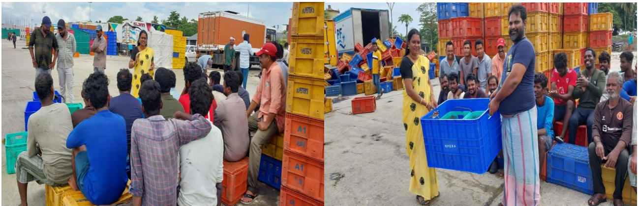
Harbour based program and distribution of Fisher aid material at Sakthikulangara