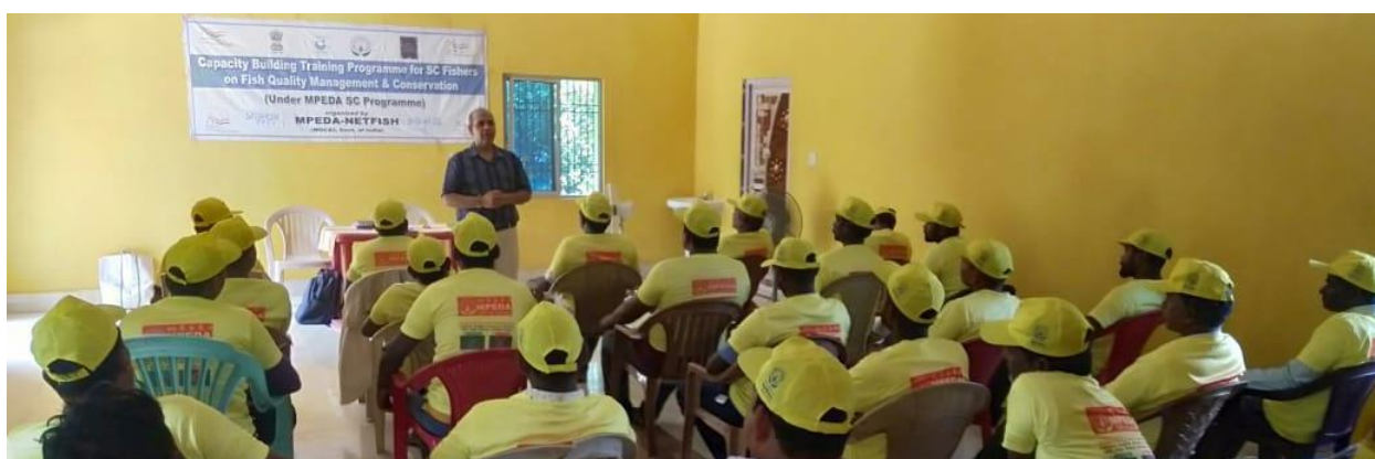
SC Fisher training programme