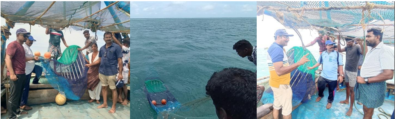
Participation in the TED trials at Mandapam