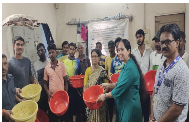
Fishing Harbour based program at New ferry wharf