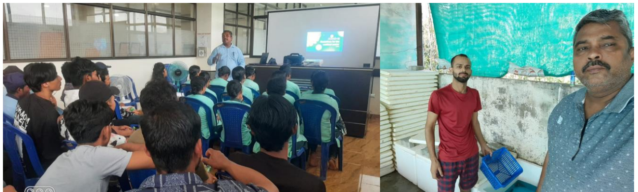
Seafood Processing center training