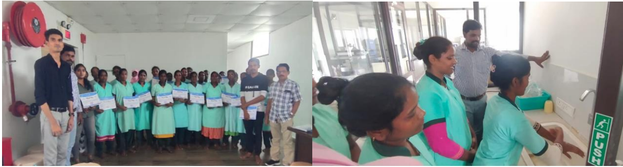
Seafood processing centre program