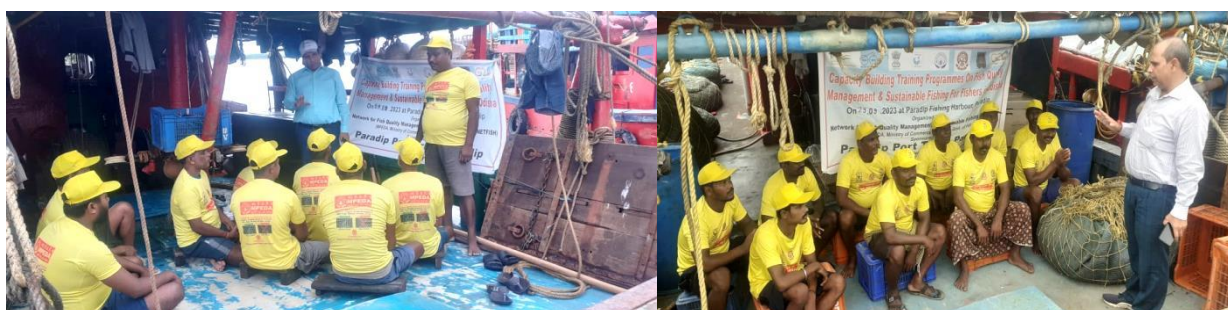
Harbour based programs at Paradeep