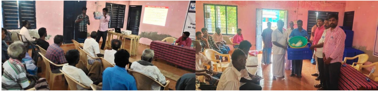
SC fishers awareness programme on 30 th Sep. 2023 at T.S. Pettai