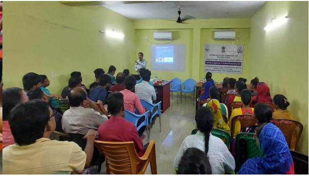
Seafood training program at Diamond Harbour