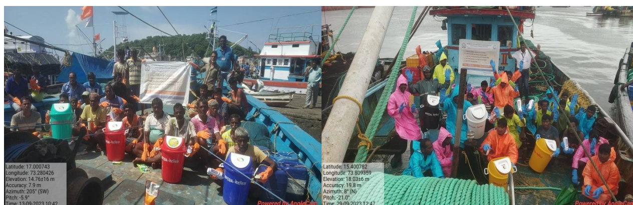
Fishing Harbour based programs at Mirkarwada and Vasco