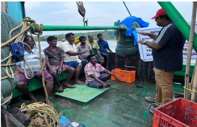
Fishing Harbour based program at Machilipattinam