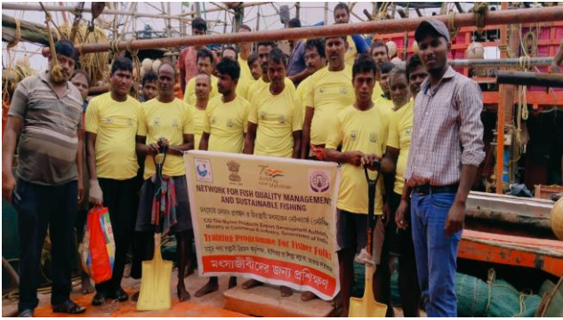
Harbour based programs at Deshapran