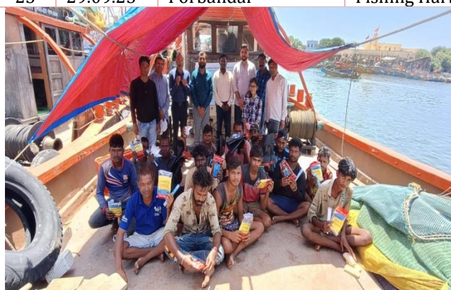
Fishing Harbour based program at Porbandar