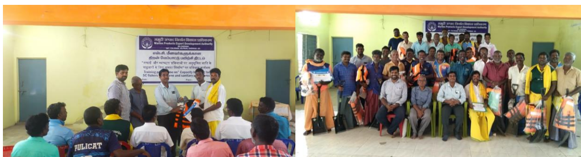
SC fishers training at Pulicat on 27 th Sep. 2023