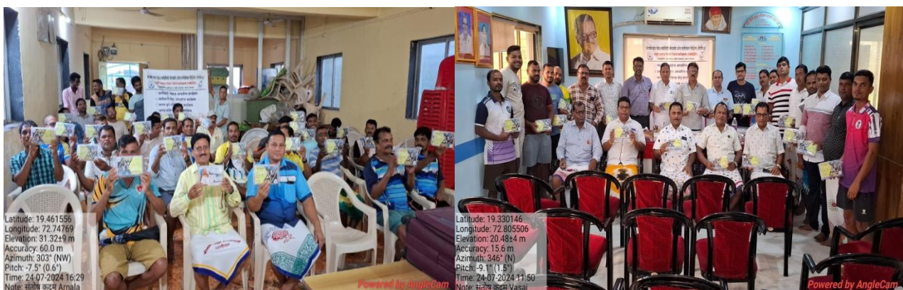
Fishing Harbour based program at Arnala & Vasai