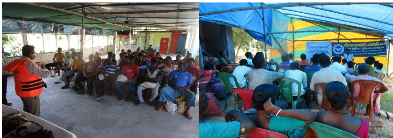
NETFISH funded training programme for SC fishers at Narayanpur & Sudhangsupur