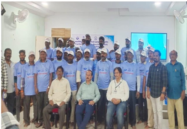
TED awareness program at Yanam