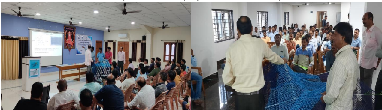
Awareness program on TED at Mangrol