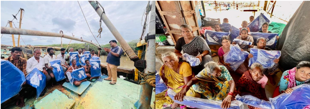
Fishing Harbour program at Machilipatnam