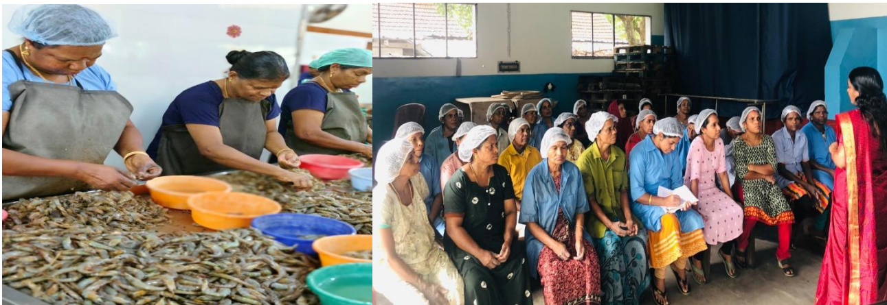
Pre-processing centre program at Eramalloor