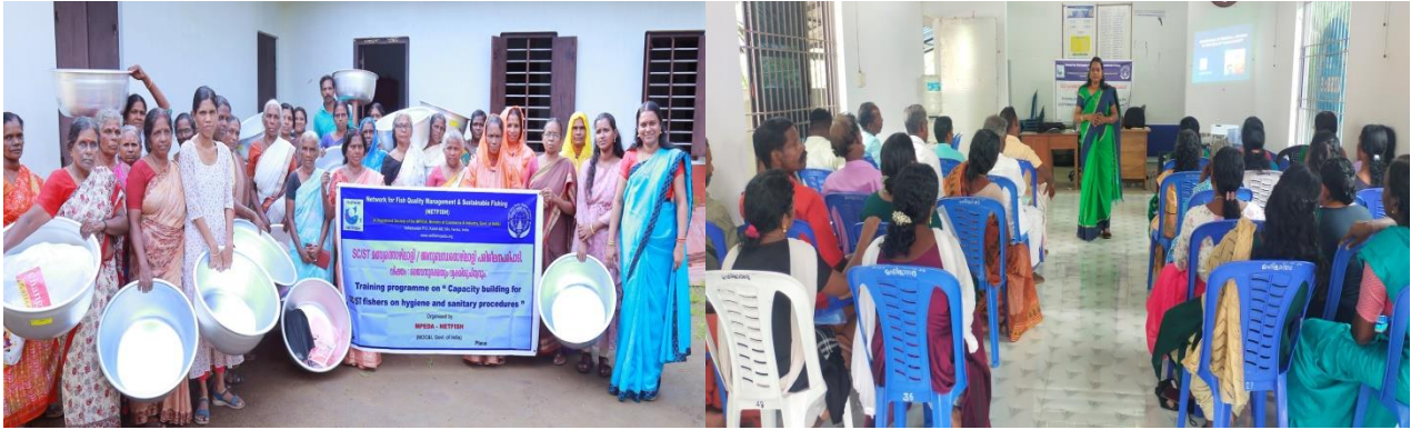
Awareness program for SC fishers at Vaikom