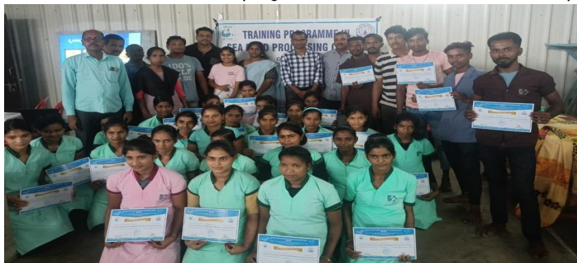
Seafood Processing centre program at Mangalore