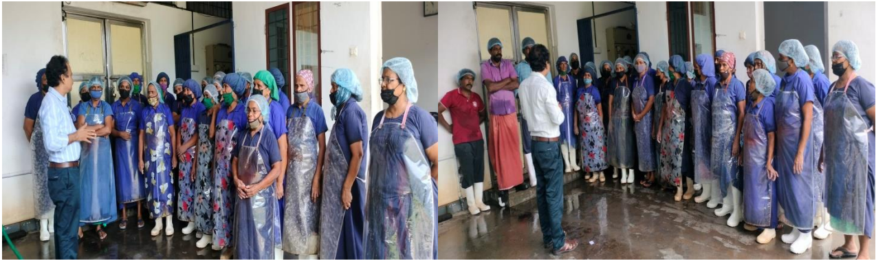
Pre-processing centre program at Maliankara