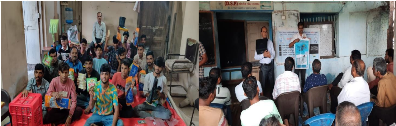
Fishing Harbour based program at Veraval & Mangrol