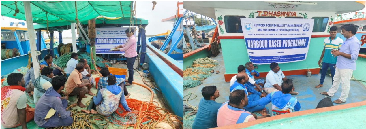
Fishing Harbour based program at Pazhayar