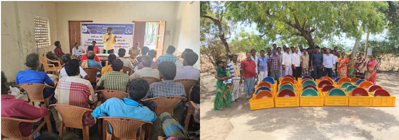
NETFISH funded awareness program for SC fishers at T.S.Pettai & Cuddalore