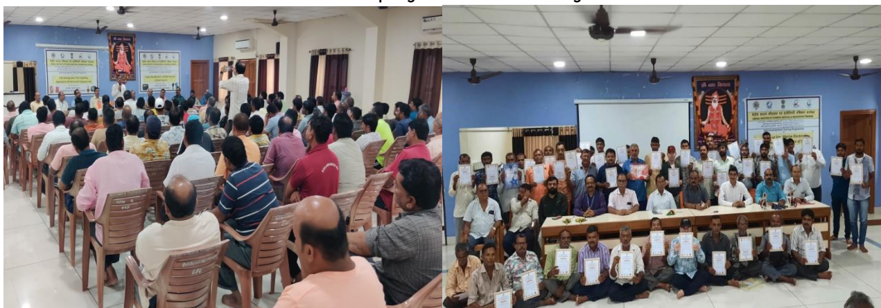
Joint Program with CIFNET