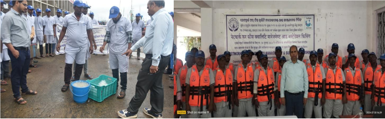
NETFISH funded training programme for SC fishers at Dhamara & Paradeep