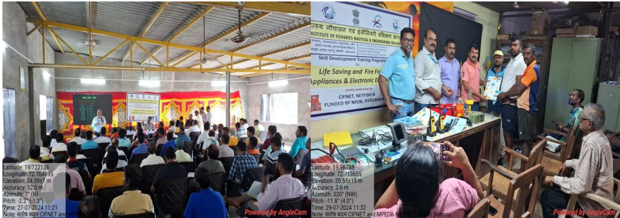
Joint program with CIFNET