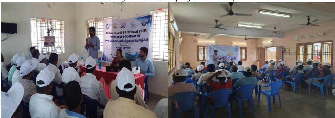
Awareness program on TED at Mudasaloodai & Karaikkal