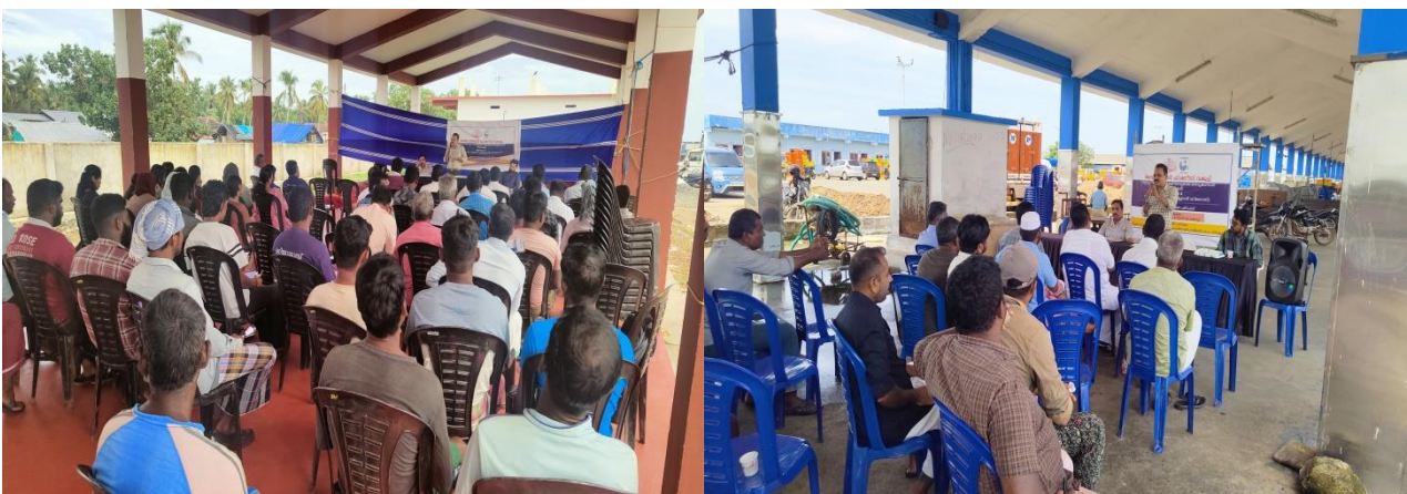
TED awareness program at Tanur & Ponnani