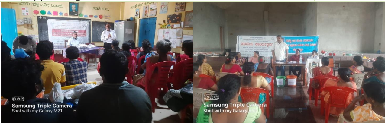
NETFISH Funded awareness program for SC fishers at Ankola & Udupi