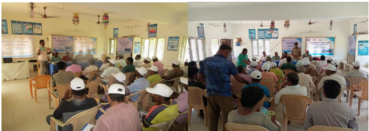
TED awareness program at Tuticorin