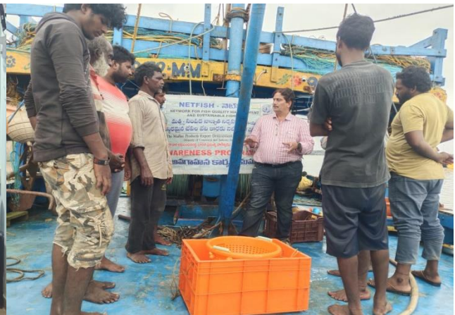
Fishing Hrabour program at Kakinada