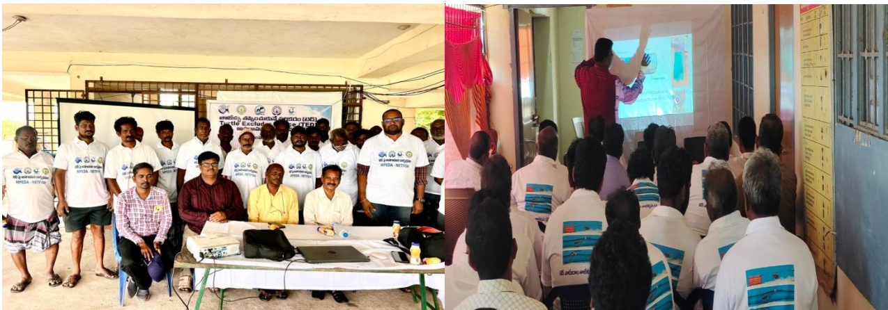
TED awareness program at Machilipatnam & Nizampatnam