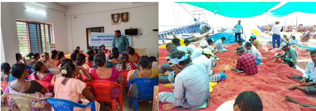
Fishing Harbour program at Malpe & Bhatkal