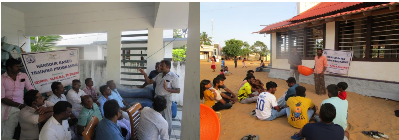
Fishing Harbour based program at Vallavilai & Poothurai