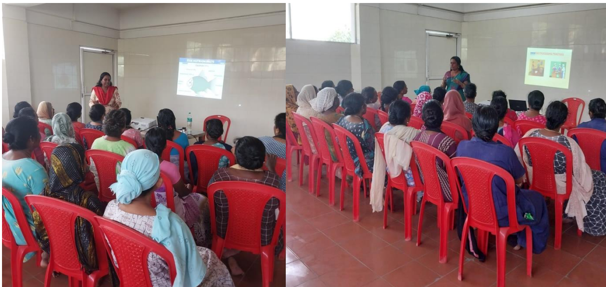
Pre-processing centre programs at CPC, Ambalapuzha