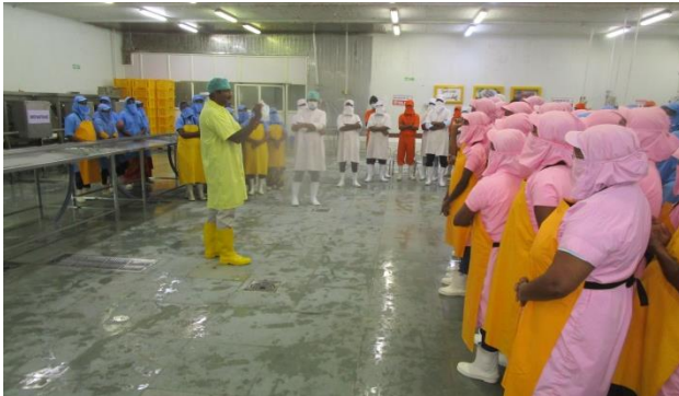
Seafood unit training