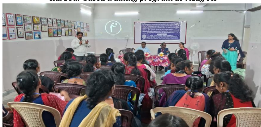
RD MPEDA SC-Seafood Training program at Vizag