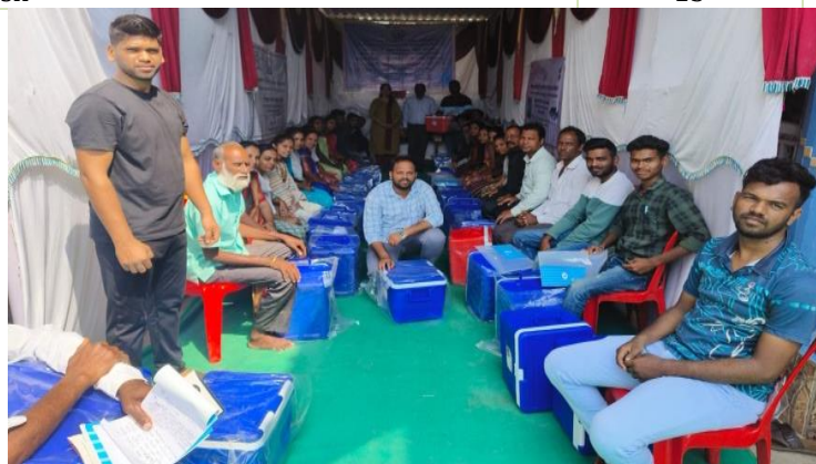
RD MPEDA SC Fund- Fishing Harbour based program