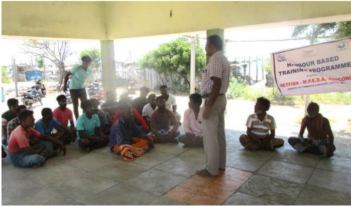
Awareness class at Chippikulam LC