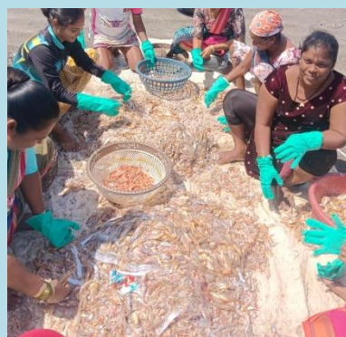
Adoption of use of handgloves and plastic baskets at Uttan