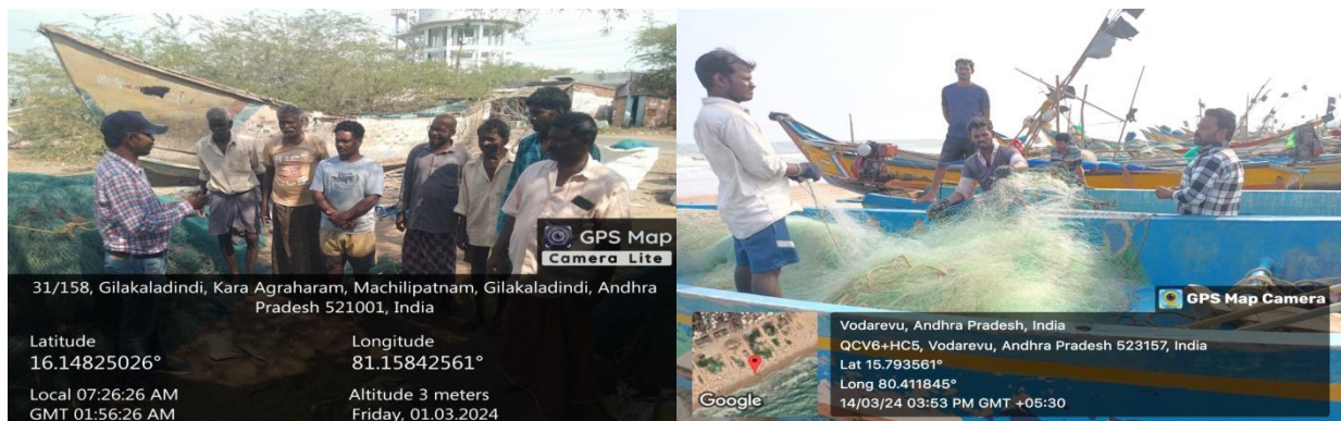
Awareness by HDCs