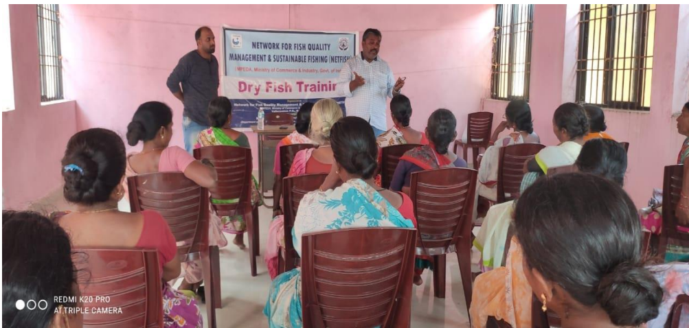
Fishing Harbour based program at Malpe