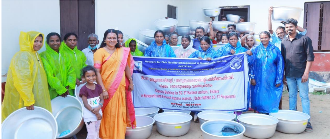
MPEDA Funded Fishing Harbour based program