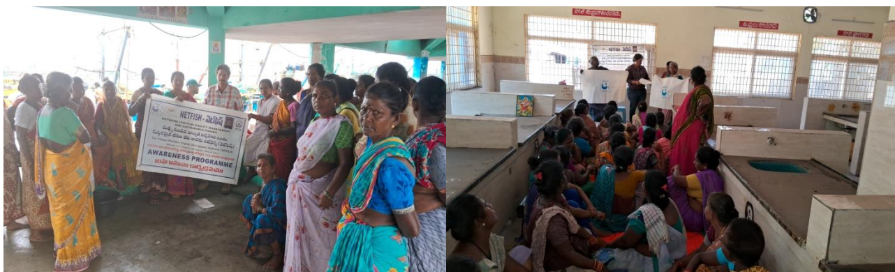
Harbour based training program at Vizag FH