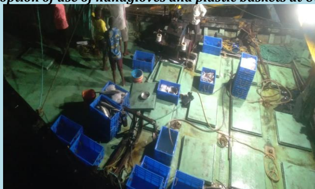
Increased use of plastic crates by fishers at Sassoon dock