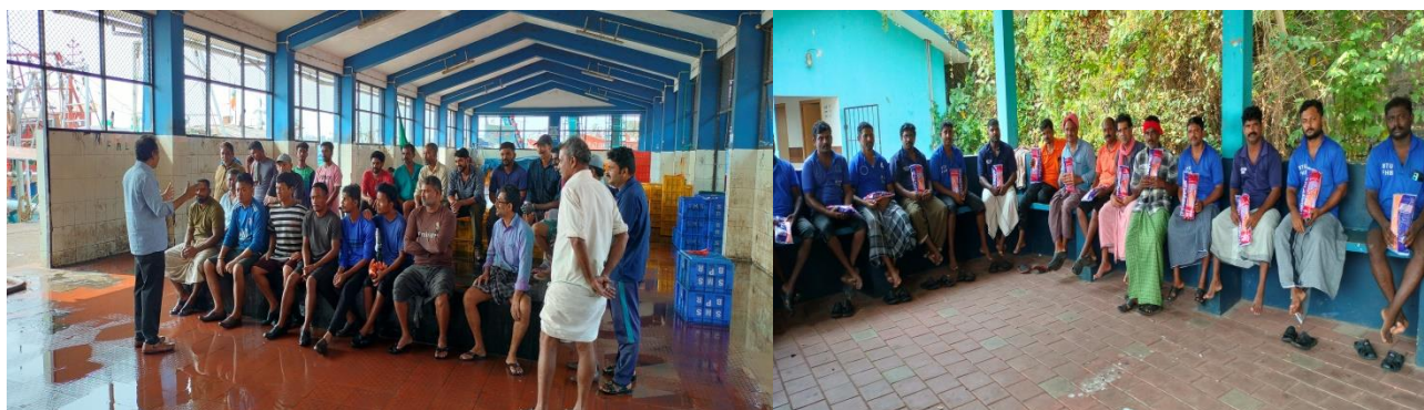
Fishing Harbour based program at Beypore