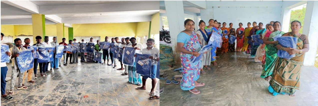
Fishing Harbour and Dry fish program at Vodarevu