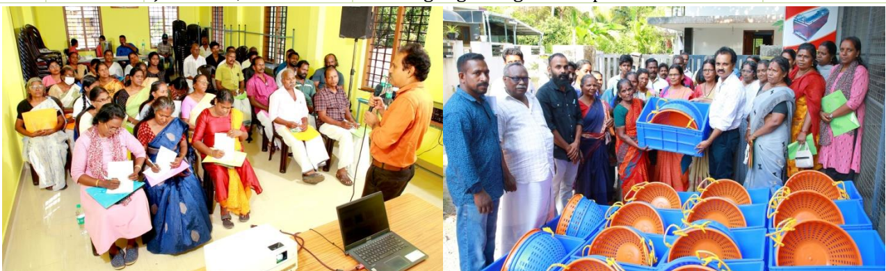
MPEDA Funded Fishing Harbour based program and Fishermen aid distribution