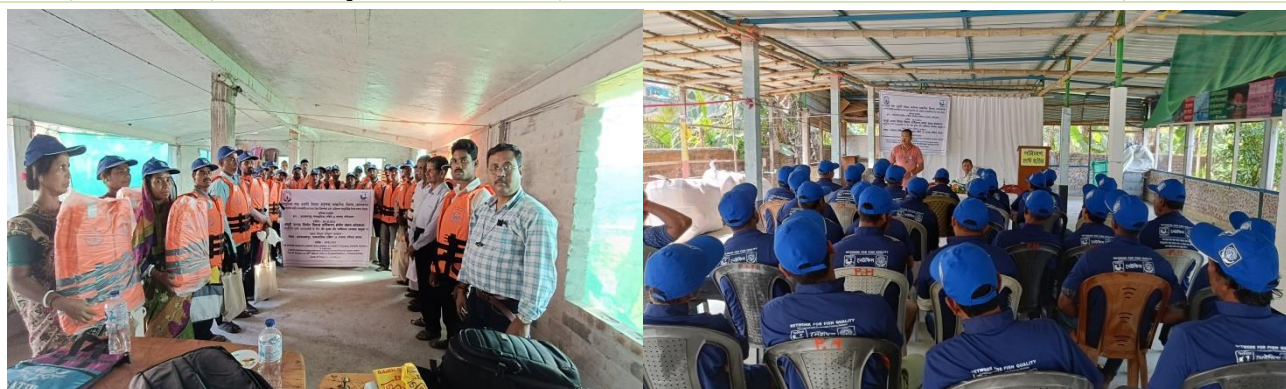
MPEDA Funded awareness program for SC fishers