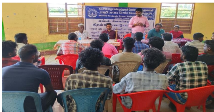
RD MPEDA SC Fund-Fishing Harbour based program