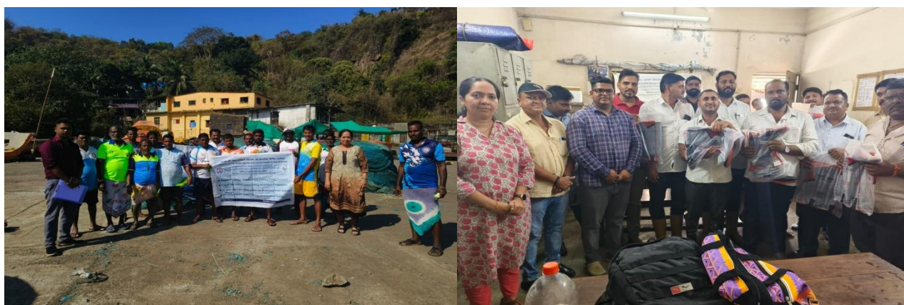
Fishing Harbour based program at Uttan & New Ferry Wharf