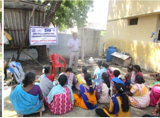
Dryfish worker's program at Theresapuram