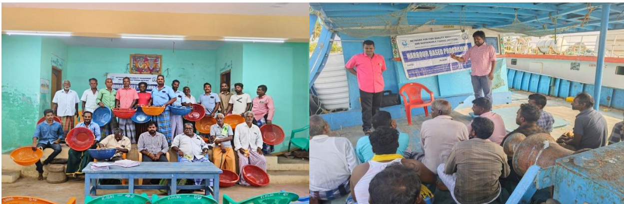
Fishing Harbour based program and fishermen aid distribution