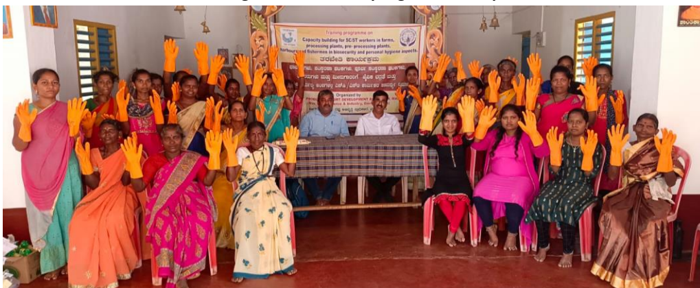
MPEDA Funded Fishing Harbour based training program for SC fishers at Ankola