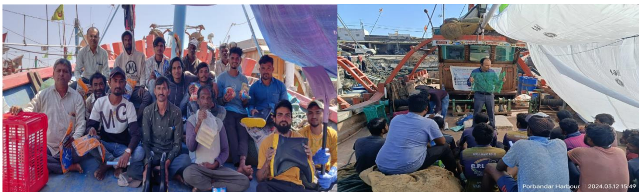
Fishing Harbour based program at Veraval & Porbandar