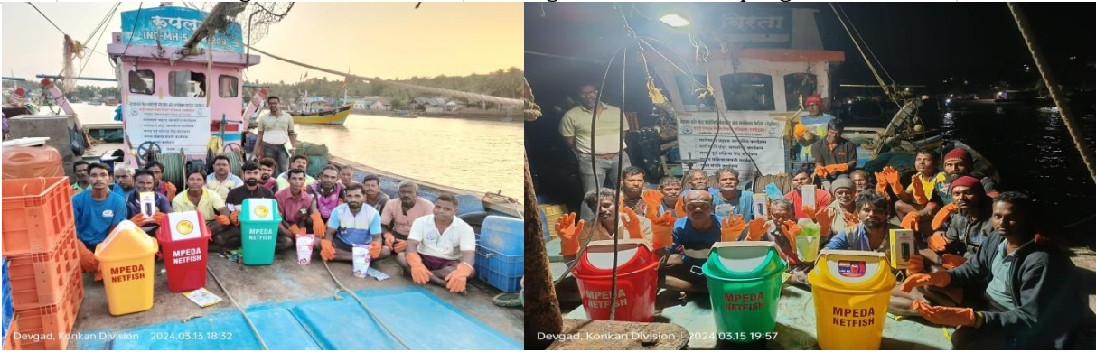
Fishing Harbour based program at Devgad