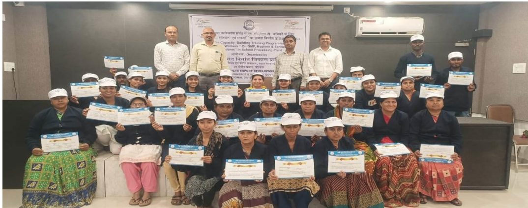
RD MPEDA SC-Seafood Processing plant training program