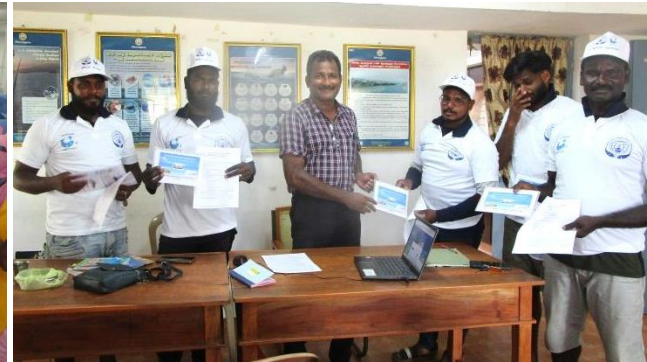
Marine Observer Training at Thengaipattinam