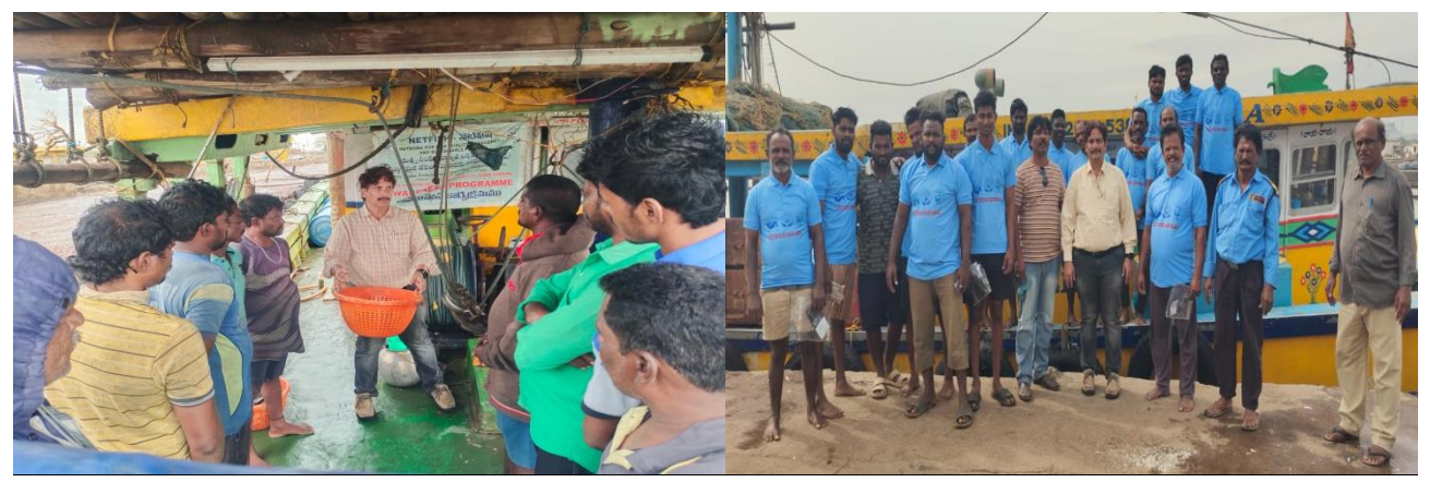
Harbour based program & TED Awareness program at Kakinada