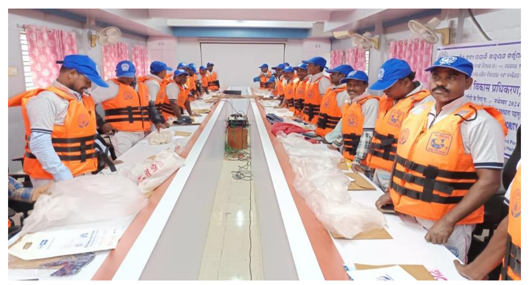
NETFISH funded training programme for SC fishers at Dhamara