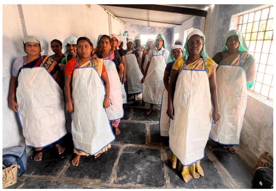
Pre-processing center program at Chirala