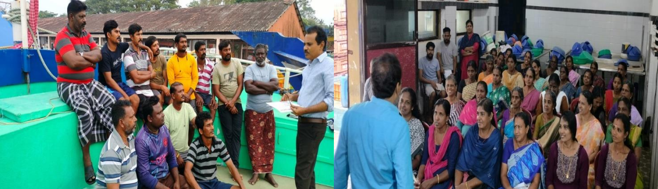
Fishing Harbour based program at Munambam