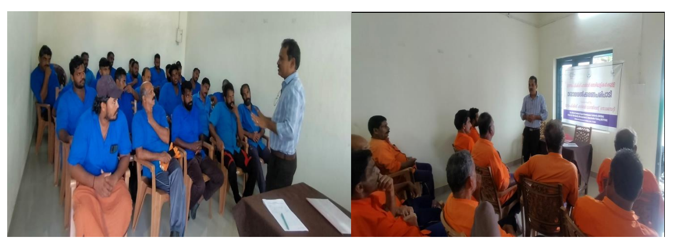
MFHMS funded awareness program at Munambam