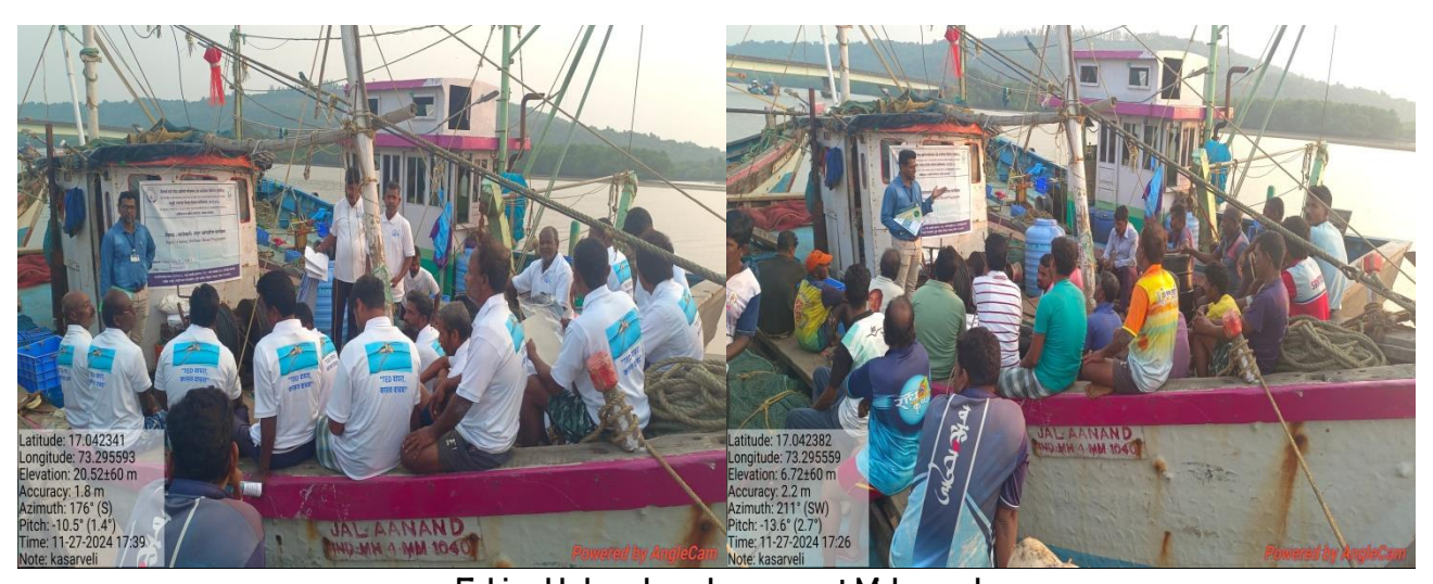
Fishing Harbour based program at Mirkarwada