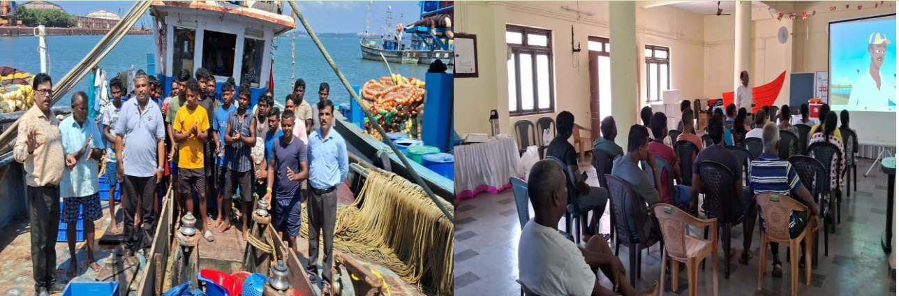
Harbour based program at Vasco