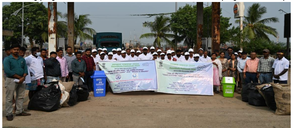
Swachhta Pakhwada-Harbour clean-up program at Deshapran FH

> Details of information disseminated to stakeholders on social media: