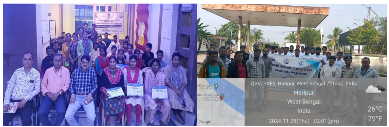
Seafood training programs at Kolkata