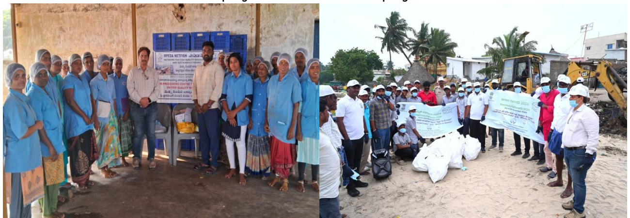
PPC training program at Beemunipatnam