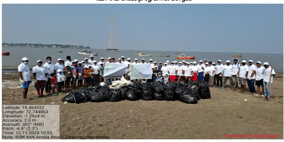
Swachhta Pkhwada-Beach clean-up program at Arnala