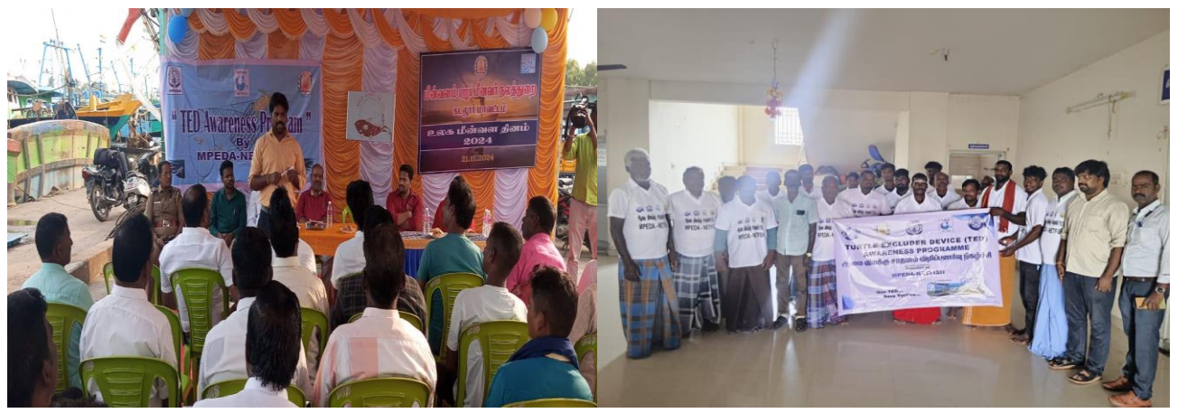
TED Awareness program at Cuddalore & Nagapattinam