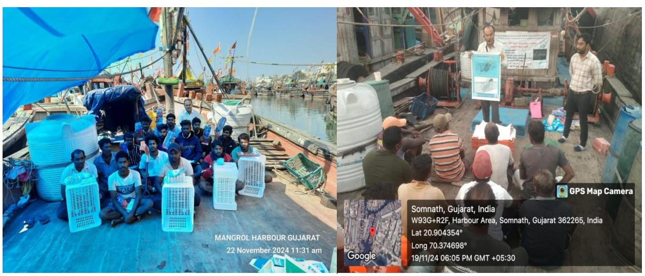
Fishing Harbour based program at Mangrol & Veraval