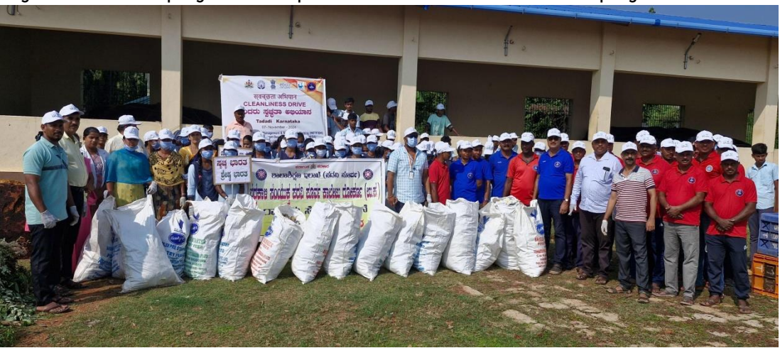
Swachhta Pakhwada- Harbour clean-up program