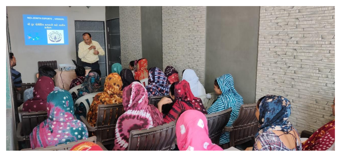
Seafood processing training at Veraval