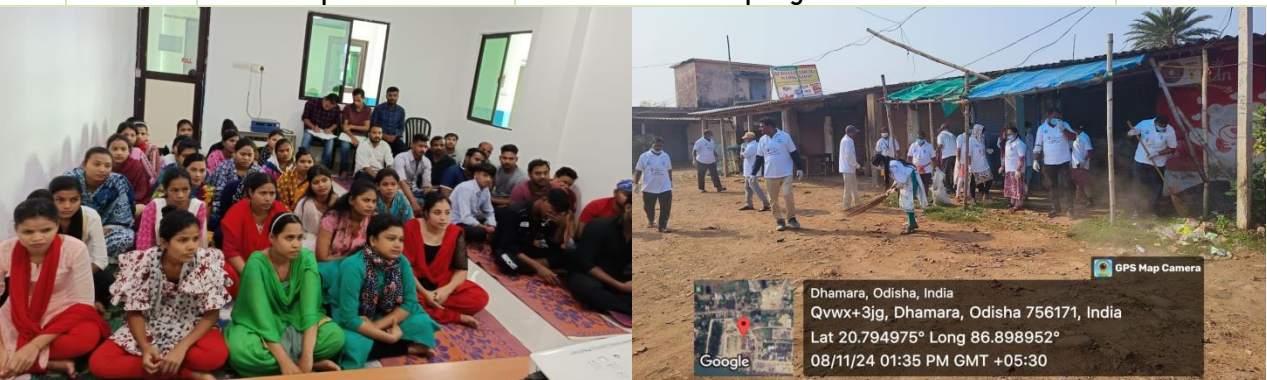
Seafood processing program at Balramgadi